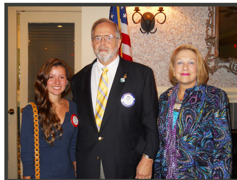
Photo from the October 9 Club Meeting