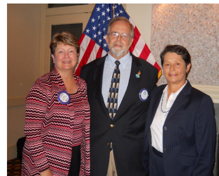
Photo from the August 21 Club Meeting