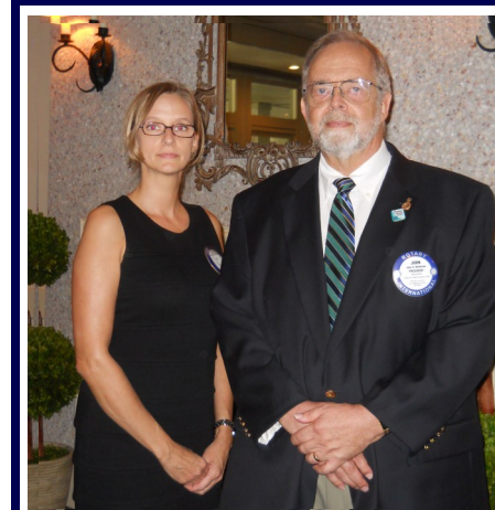
Photo from Last Week's Meeting

He is a graduate of the University of Georgia and the Air Force R.O.T.C. program at UGA. He holds a Bachelor of Science degree in Political Science.