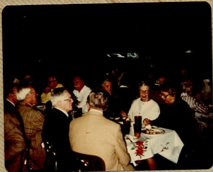
Scenes at Epworth during the Hawley Singers Musicales on December 6, 1983.