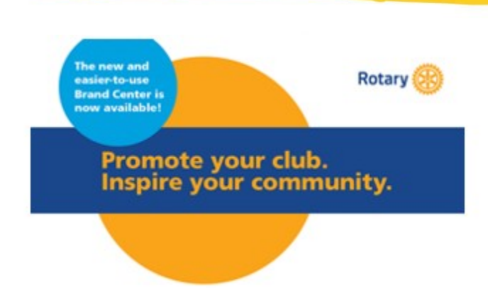
Sec. E. TOOLS: Resources, Social Media, Contact Us & Useful Links

Visit the Brand Center to create club promotions that are distinctly Rotary.