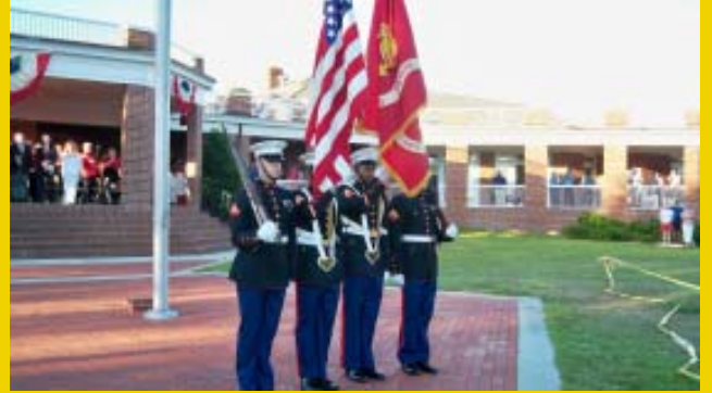
The Marine Security Forces posted the colors during the annual program.