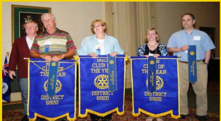
Club of the year awards went to Augusta South, small club; Savannah West, medium club; Augusta West, large club and Dublin, extra large club.